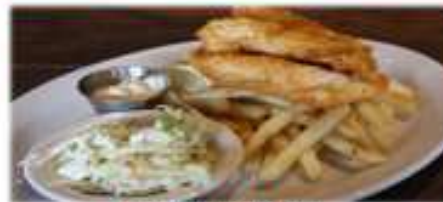
Fish and Chip Plate

2 PCS FRIED FISH - FRENCH FRY'S - COLE SLAW - WATER OR SODA